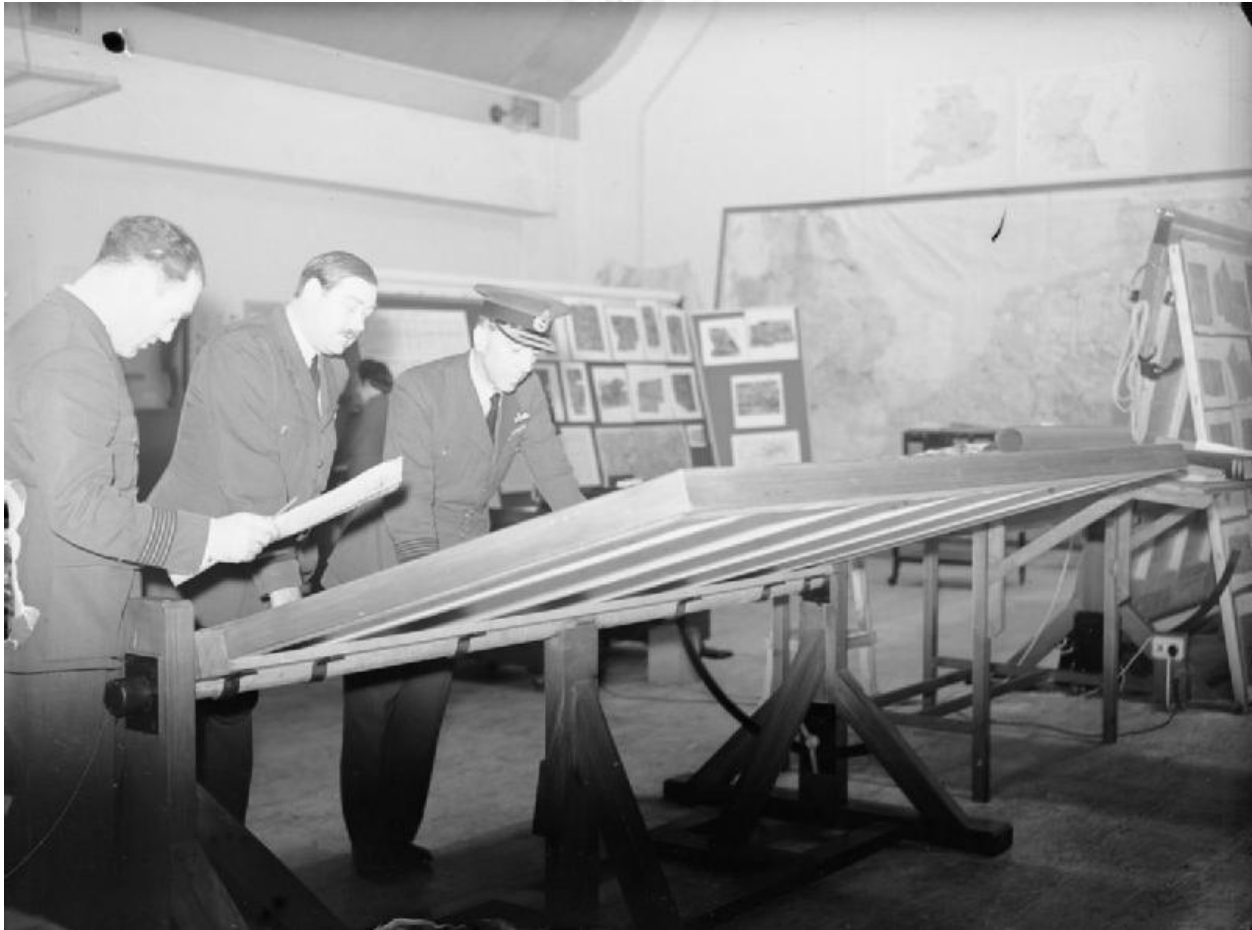
Air Marshal Sir Richard Peirse, Air Officer Commanding in Chief, RAF Bomber Command (wearing cap), studies the situation map in the Operations Room at Bomber Command Headquarters, near High Wycombe, Buckinghamshire. To his right stands his Senior Air Staff Officer, Air Vice-Marshal R Saundby.